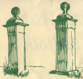
Parham House Gateway