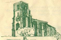
St. Mary's Church